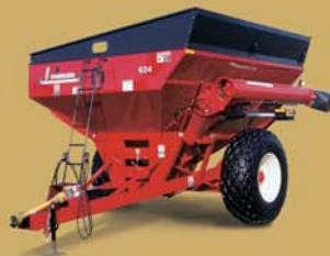
Model 624 600 bu. capacity