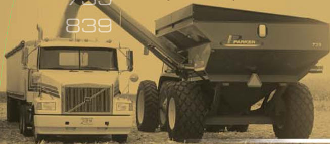
Model 739 750 bu. capacity