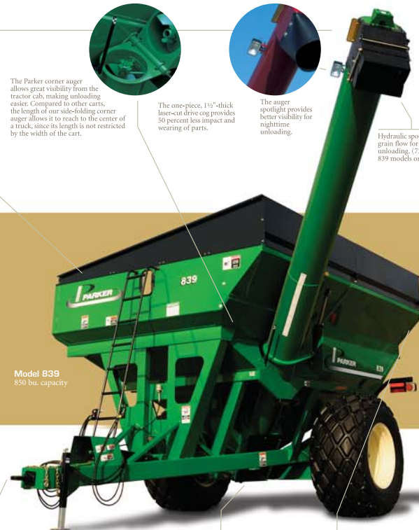
Model 839 850 bu. capacity

Hydraulic spout diverts grain flow for easier unloading. (739 and 839 models only)