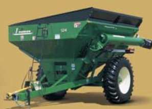
Model 524 500 bu. capacity